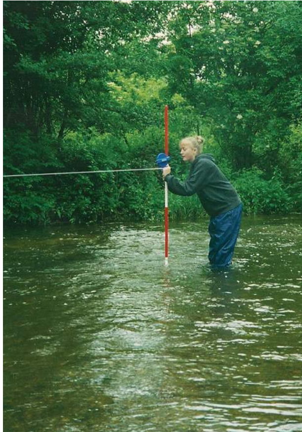
Photograph B for Question 8